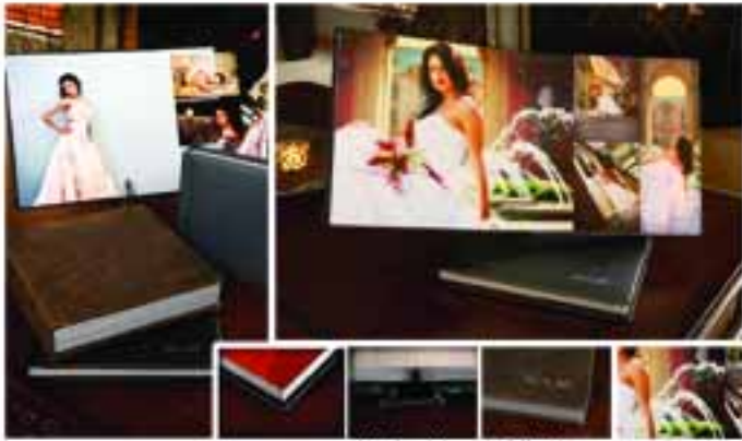
Tight Round Corners Album spreads lay flat when opened Gold or Silver Embossing on cover Nearly invisible gutter for great panoramas